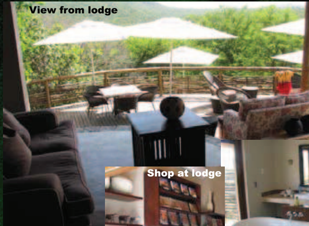
View from lodge