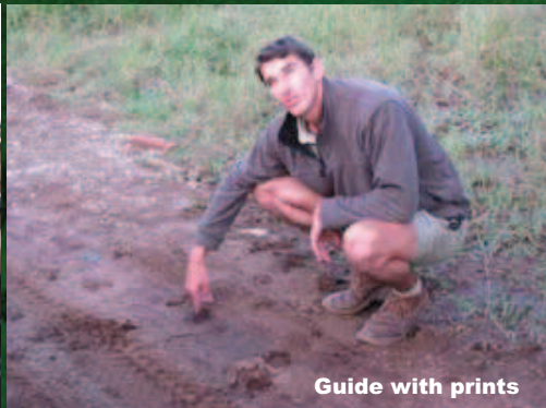
Guide with prints