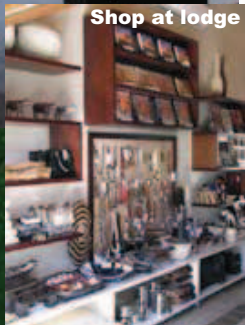
Shop at lodge