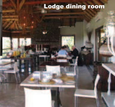
Lodge dining room

South Africa boasts some of Africa's best-maintained safari parks. World-famous Kruger National Park, the size of Wales, is the country's premier park. But South Africa also offers many other terrific but lesser-known private game reserves such as Phinda Resource Reserve in Kwa-Zulu Natal northeast of Durban and Richards Bay.