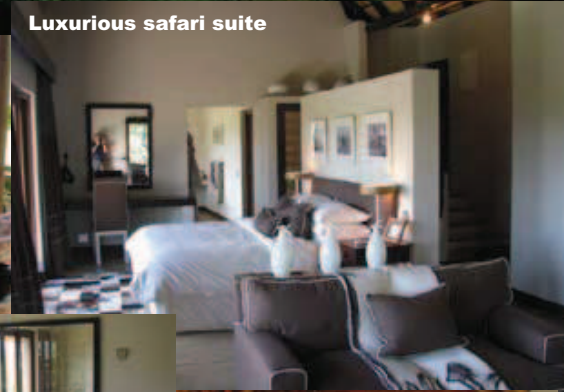
Luxurious safari suite