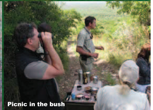
Picnic in the bush