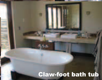
Claw-foot bath tub